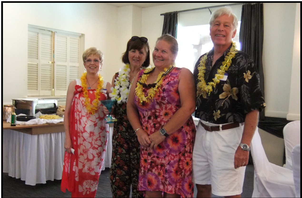
2016 Summer Party at Pontchartrain Yacht Club